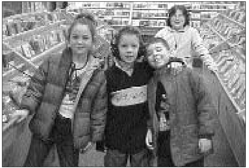
Bentworth Elementary Center students tune in to their favorite music at Borders in South Hills.

New and gently used children's books, in bags and boxes and backpacks. They came in by the hundreds and thousands during "For the Love of Books," so many that they're threatening to spill out of the Mon Valley Education Consortium's storage locker at the Waterfront in Homestead.