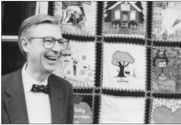
Fred Rogers at the MVEC office in June of 1993

In 1990, deep in the planning process for the 1992 National Dropout Prevention Conference the Consortium was hosting, I asked Fred if he would consider delivering the opening keynote. He said he'd be honored, but only if we