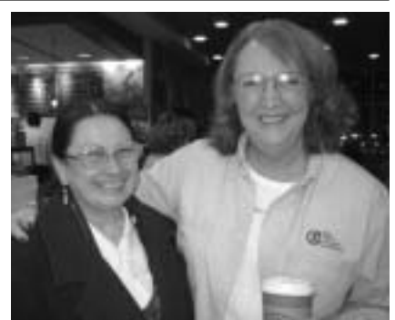
AT THE KICKOFF