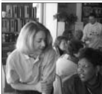
FOR THE LOVE OF BOOKS 2003