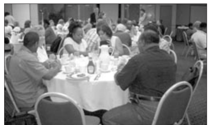
The East Allegheny team at the Governor's Institute for Parent Involvement in Harrisburg.

Our expectations are high for all students. Lofty goals can be met by day-to-day diligence. We are keeping our eyes on the prize – a quality public school experience for every child, a chance at a successful and productive life.