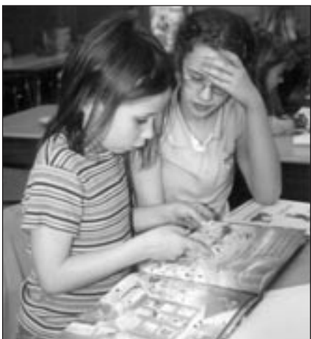
Older students helping younger peers is a favorite Mon Valley Reads activity.

Each participating school receives commemorative Mon Valley Reads bookmarks for students, a small keepsake for celebrating the joys of reading with the Consortium. Signup information for this portion of the Power Reading on the River program will be coming in February/March.