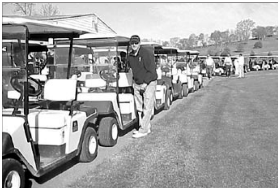
The annual golf outing co-sponsored by the Brownsville School Action Committee has grown over the years and now draws about 130 golfers.